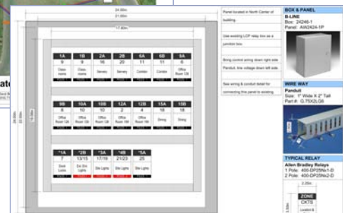
Lighting Panel – Panel Layout LCC1A